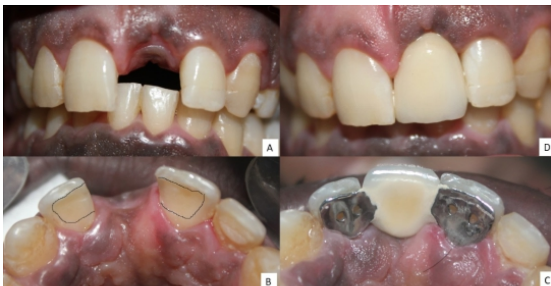
Illustration of stepwise fabrication of Maryland bridge for missing 21