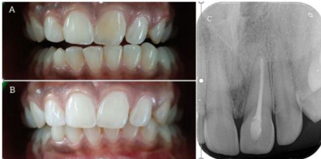
1. Figure 1 A) A labial view demonstrating a discolored non-vital upper left central incisor, upon clinical and radiographic examination, incompletely obturated tooth with a persistent periapical lesion was observed. Pain and lesion subsided after re root canal treatment. Postoperatively in two months, nonvital bleaching was planned on the tooth with sodium perborate dihydrate powder; B) Labial view showing the tooth post-two weeks of intracoronal walking bleaching procedure and the desired outcome was obtained C) Post-operative radiograph of the discolored tooth.

with satisfying long-term esthetic results (Figure 1). A successful outcome depends mainly on the etiology, correct diagnosis, and proper selection of bleaching technique 256 . The methods most commonly employed to bleach endodontically treated teeth are the “walking bleach” and the thermocatalytic techniques.