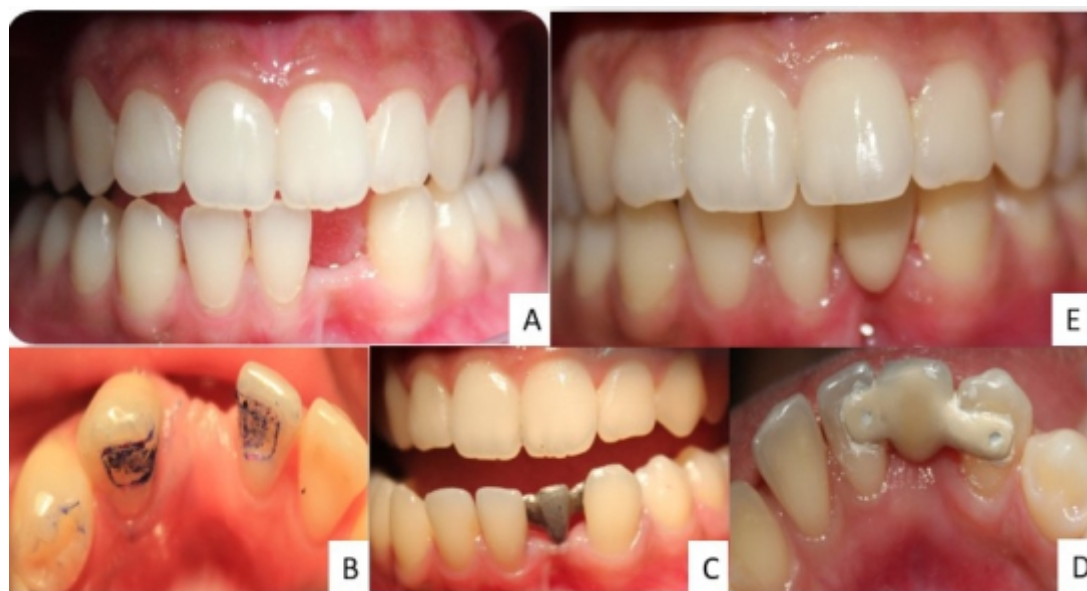
Illustration of stepwise fabrication of Maryland bridge for missing 31 A)preoperative photograph B)outline for final preparation C)metal coping D)lingual view E)facial view of resin bonded bridge

Instead of perforations, the tooth side of the