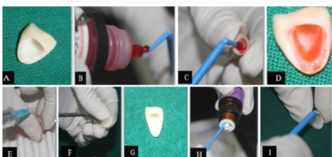
Figure I : A) Intaglio surface of lithium disilicate crown. B&C) Application of 9.5% hydrofluoric acid (HF) for 20 seconds D) Hydrofluoric acid in the intaglio surface E) Saline rinsing F) Air drying G) Dried intaglio surface ready for bonding . H&I) Application of silane coupling agents